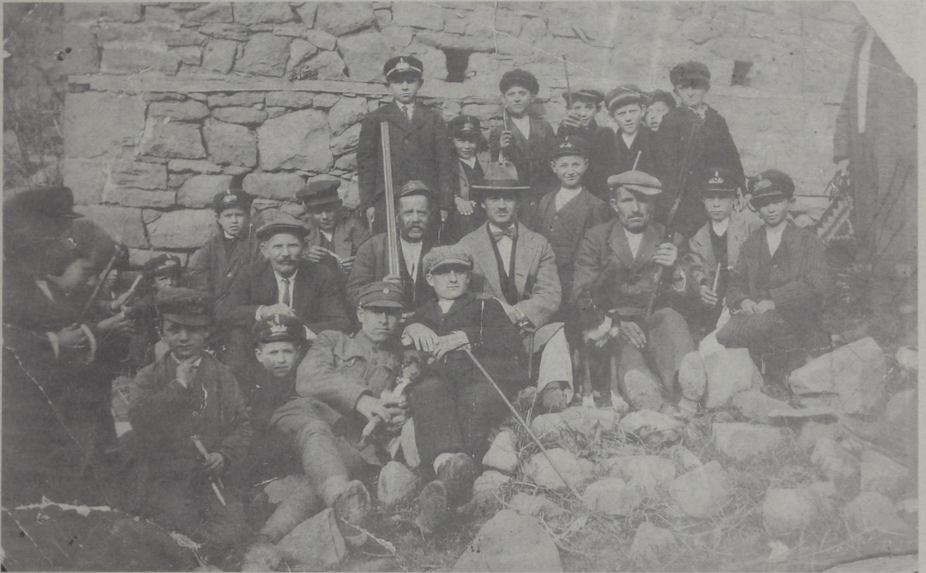
1926. Εκδρομή μαθητών στο Μοναστήρι