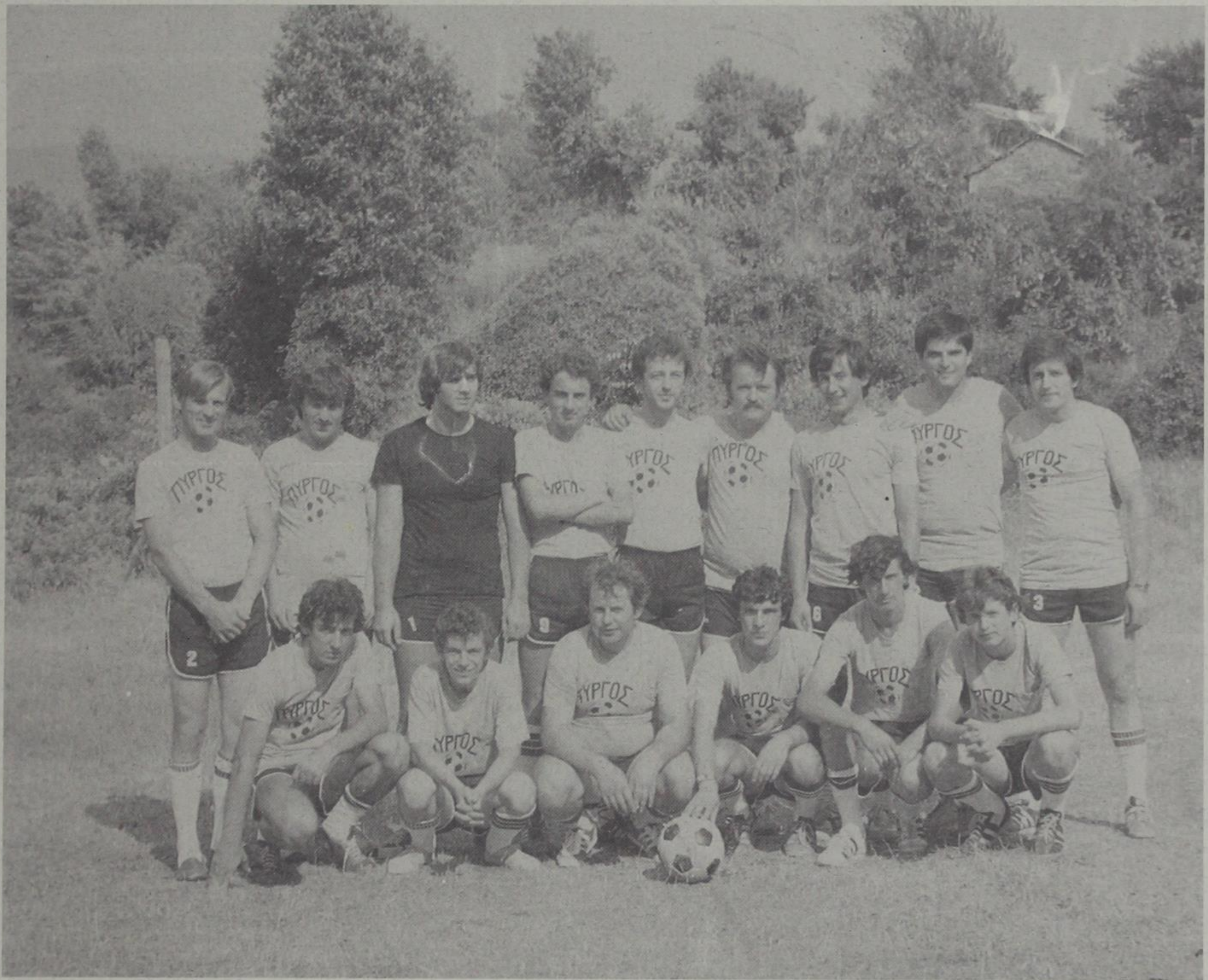
1982. Ποδοσφαιρική ομάδα του Πύργου.