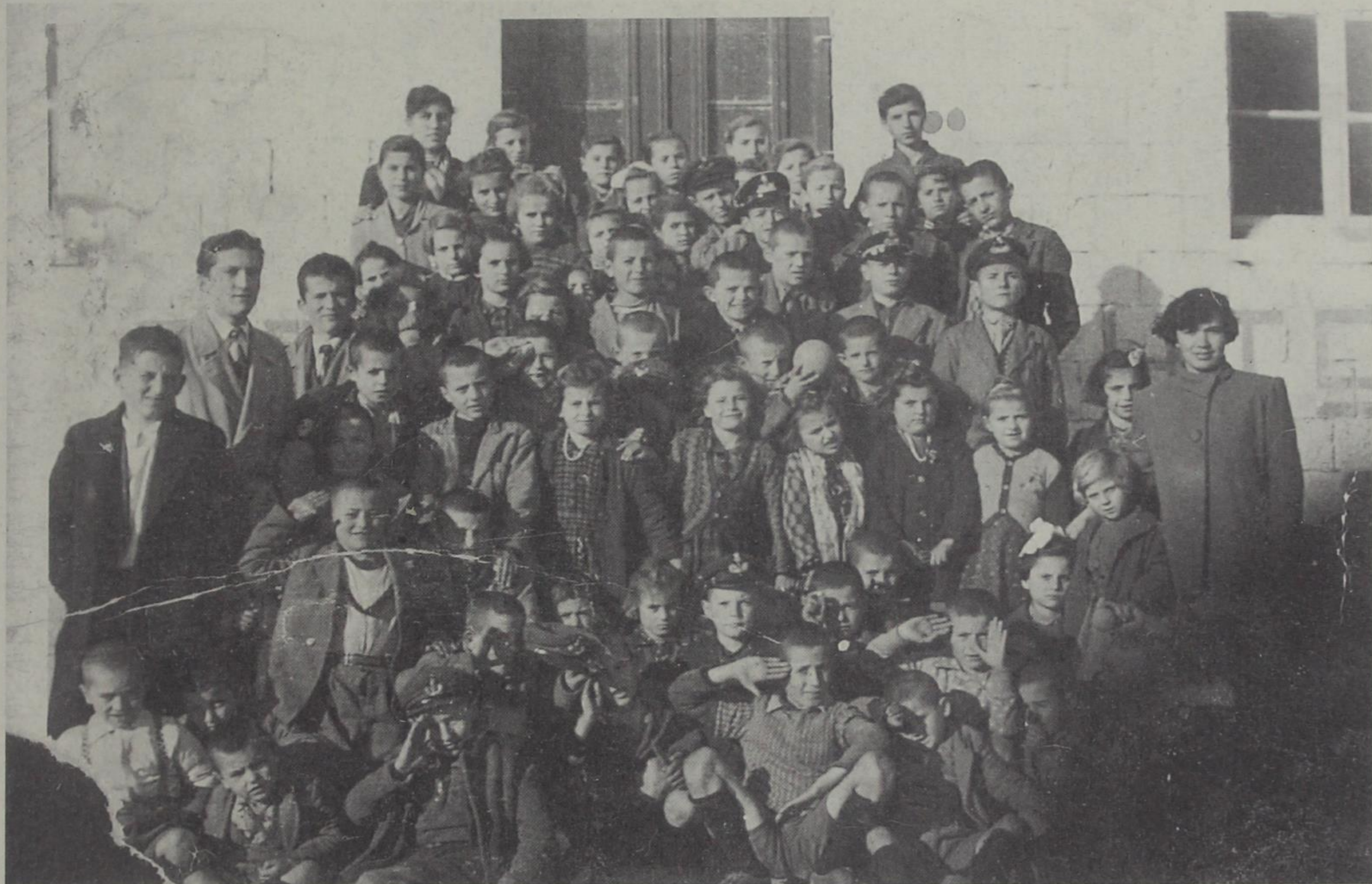
1955. Διδέσιο Πύργου.