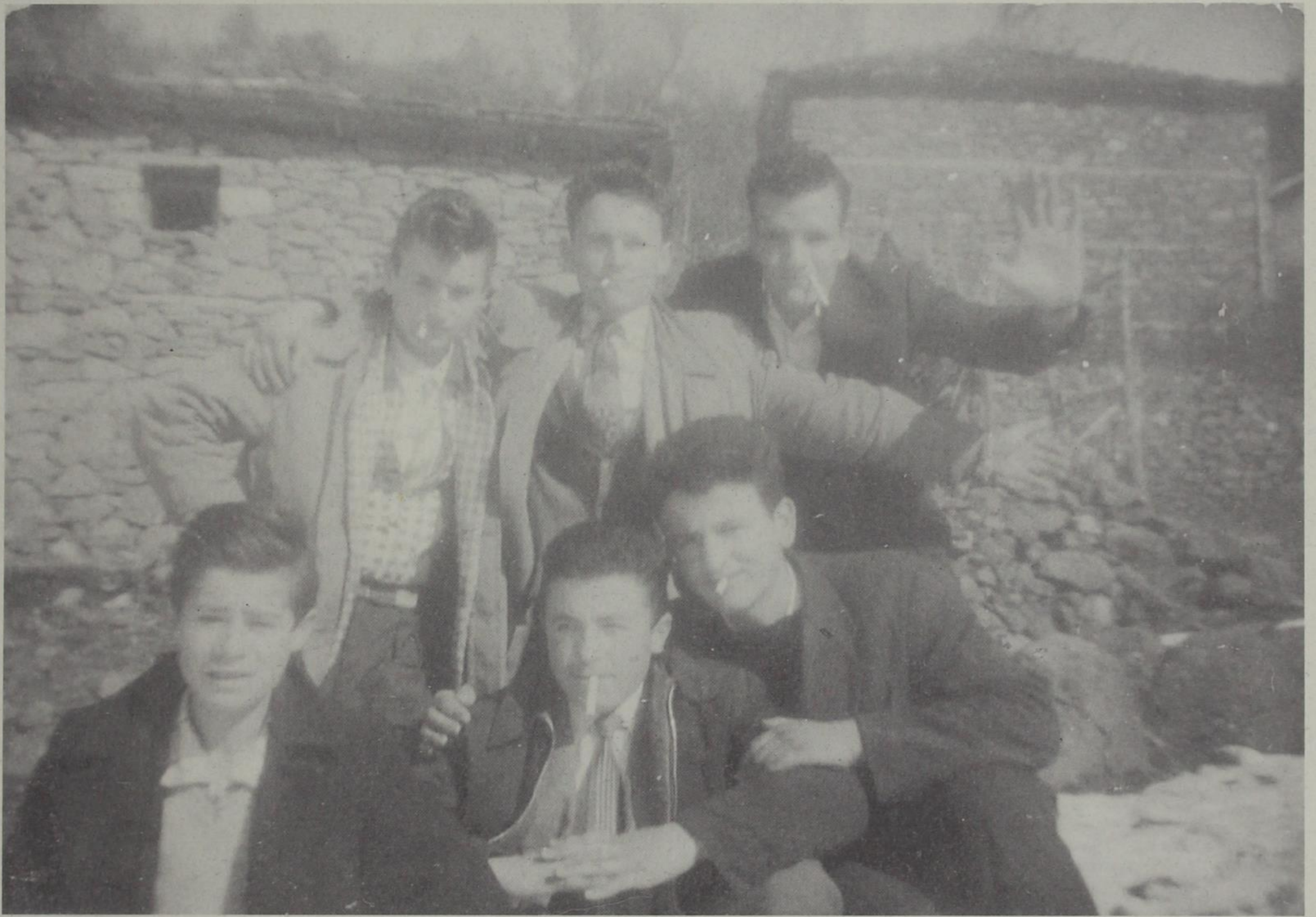
1957. Μαθητές Γυμνασίου (Το πρώτο τσιγάρο).